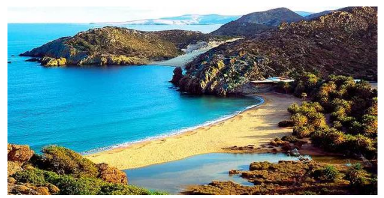
Itanos Gaia, Lassithi, Crete

In most cases the implementation has been delayed, not due to the nonapplication of the law, but because of the inability to fund them. A project that is going ahead is the Itanos Gaia project of Minoan Group Plc after the Council of State dismissed at the end of June the appeals that were made. The € 267 M project for the development of a luxury resort at the Cavo Sidero peninsula in Lassithi, Crete entered the fast track framework in December 2012.